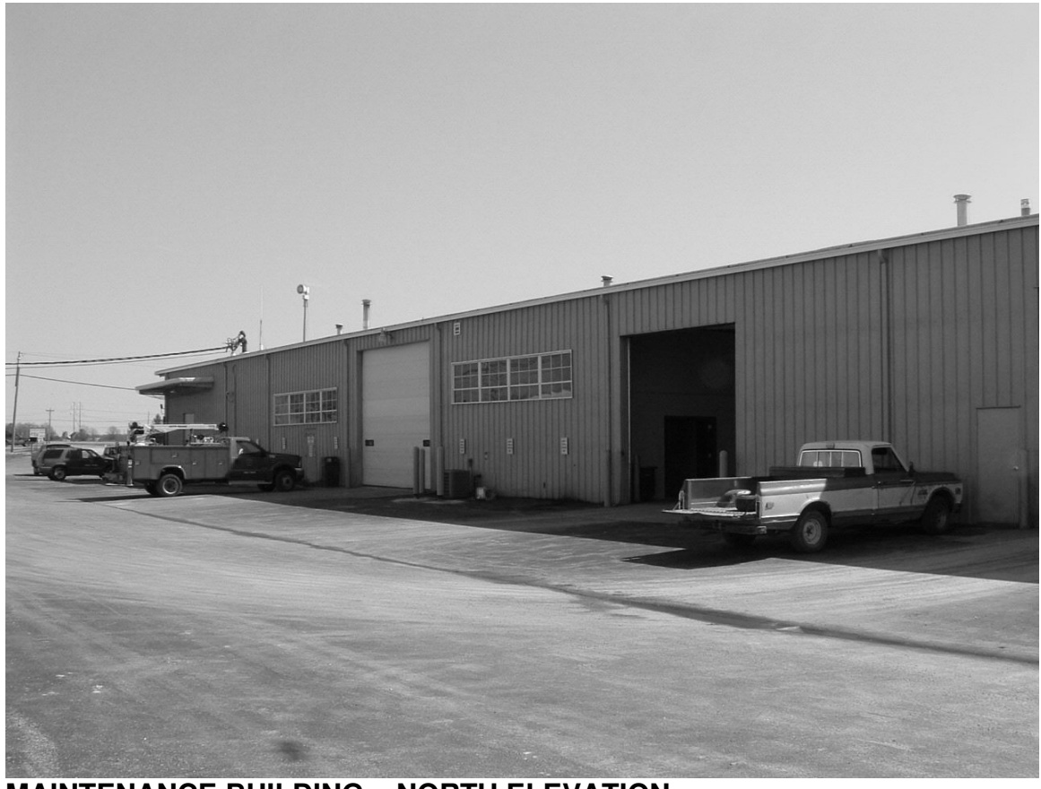
MAINTENANCE BUILDING - NORTH ELEVATION