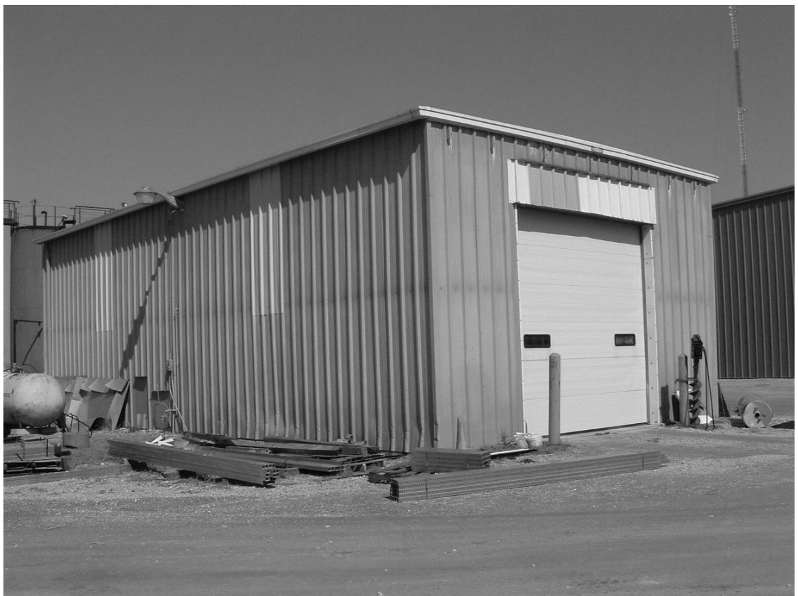
SIGN SHOP BUILDING – SOUTH AND WEST ELEVATIONS