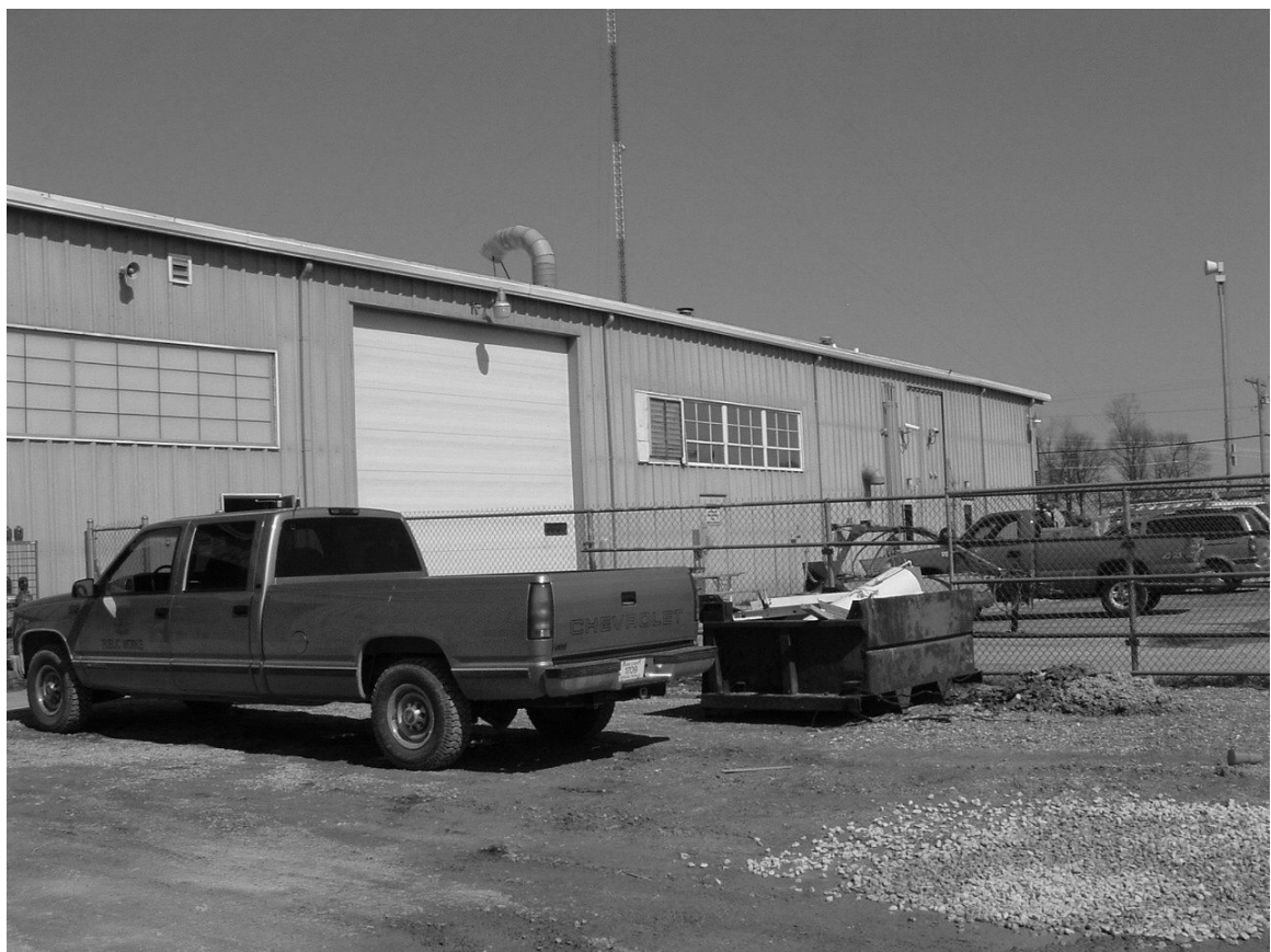
MAINTENANCE BUILDING – SOUTH ELEVATION