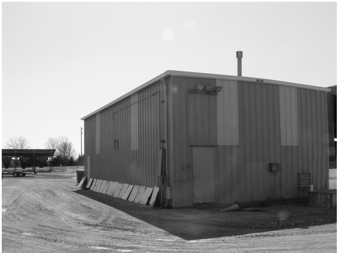
SIGN SHOP BUILDING – EAST AND NORTH ELEVATIONS