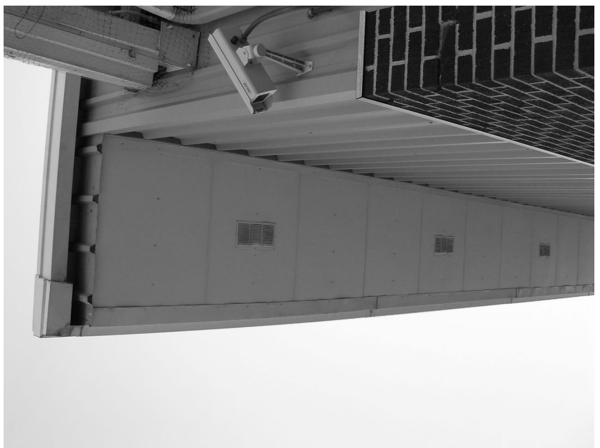
MAINTENANCE BUILDING – NORTHEAST CORNER