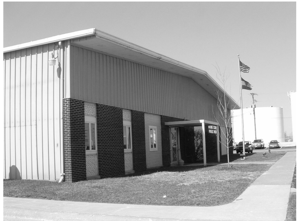
MAINTENANCE BUILDING – EAST ELEVATION