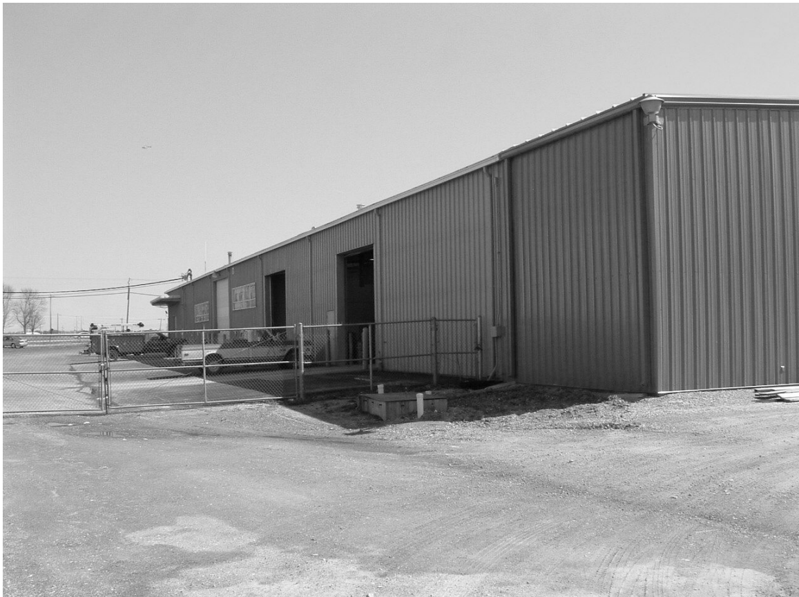
MAINTENANCE BUILDING – NORTHEAST CORNER