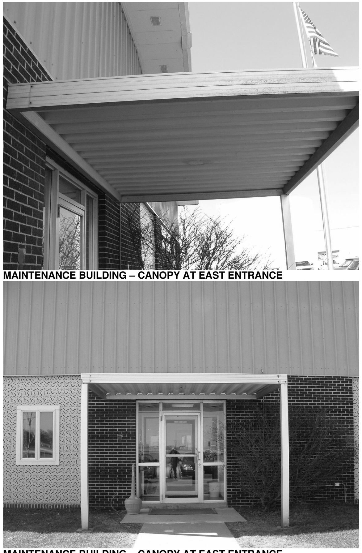
MAINTENANCE BUILDING – CANOPY AT EAST ENTRANCE