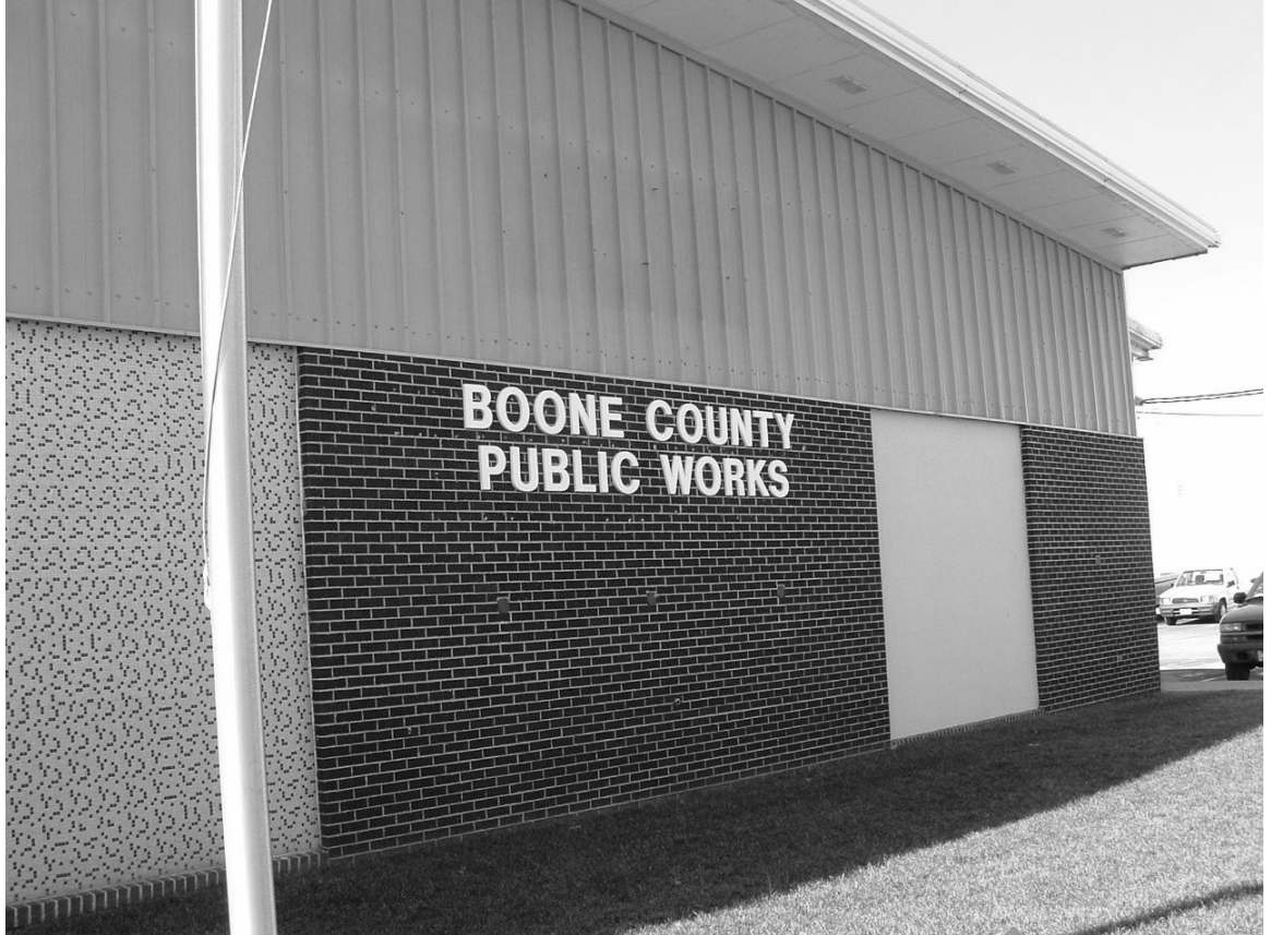
MAINTENANCE BUILDING – EAST ELEVATION