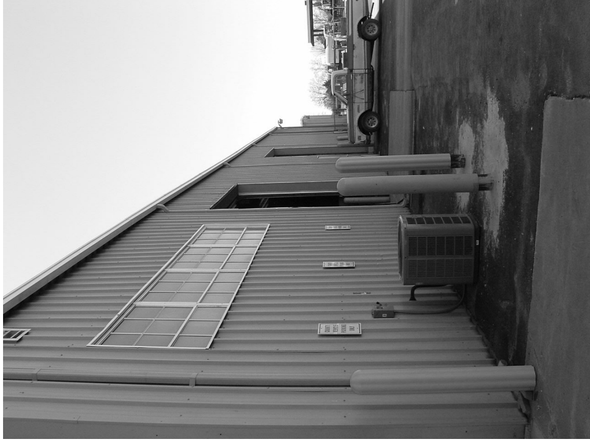
MAINTENANCE BUILDING – NORTH ELEVATION

MAINTENANCE BUILDING – SOFFIT ON EAST ELEVATION