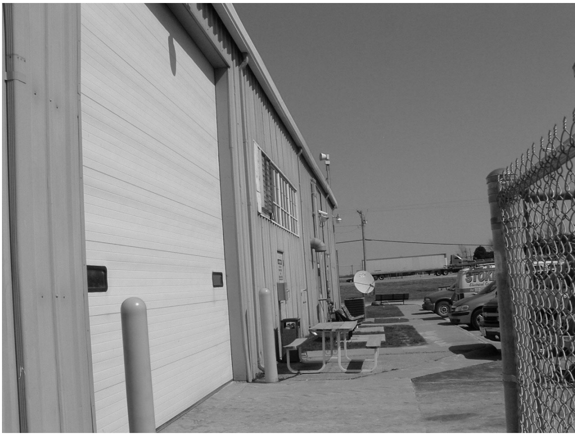
MAINTENANCE BUILDING – SOUTH ELEVATION