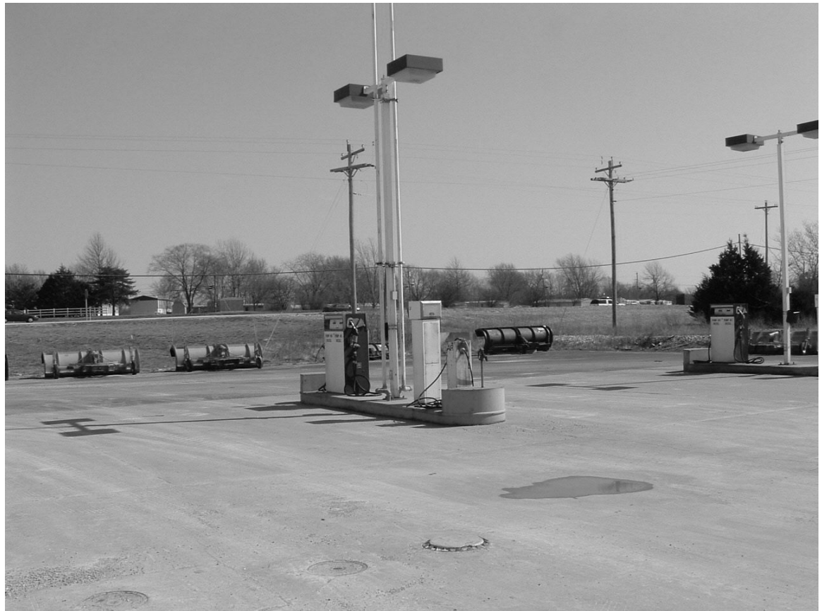
CENTER AND SOUTH FUEL ISLANDS